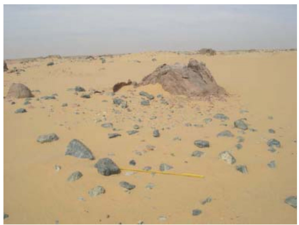
Figure 14: Work area in front of a sheltering granite outcrop.

The rough blanks were then worked with finer tools to semi-rounded vessel blanks, which defined the final stage of working in the quarries before transportation. In the northern part of the quarry areas, hundreds of such tools have been found – small hand-held axes made of dioritic rock and basalt (Figure 9). This activity took place in the margins of the quarries or in the close vicinity – frequently at places where rock outcrops forms natural shelters from the predominant northern winds (Figure 15). Piles of rock chips and vessel blank collections characterise such work areas.