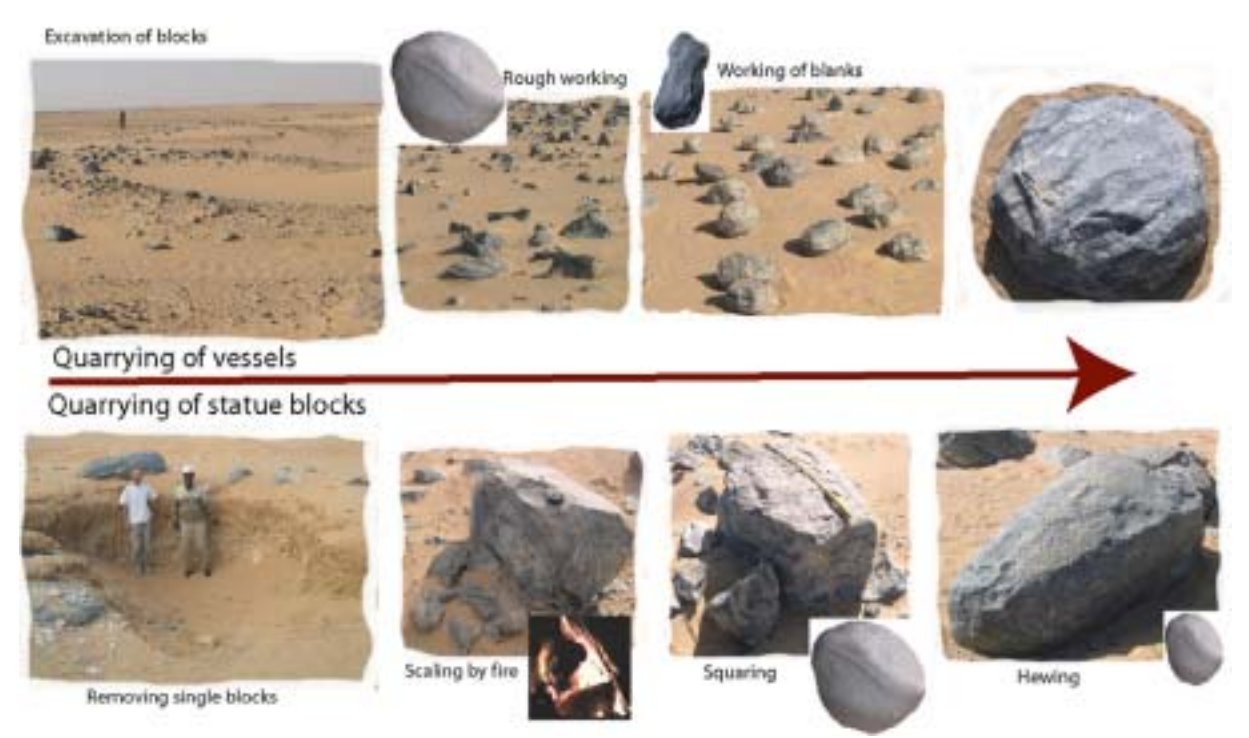
Figure 18: Summary of the quarrying process for vessels and statue blocks – from extraction to semi-finished products (vessel blanks and hewn statue blocks).

In contrast to the vessels, the banded – not the speckled – variety of Chephren Gneiss was preferred for statues. Either this variety was commonly occurring as large boulders, or there were aesthetical reasons for this choice.