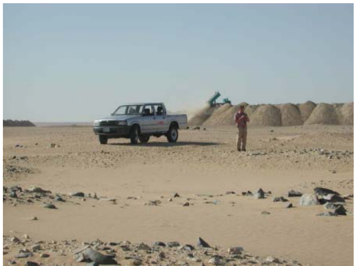
Figure 4: Mapping of ancient quarries in front of the workings at Canal 4 of the Tushka Development Project.

The South Valley Project is managed and funded by the Egyptian Government with the help of international institutions (such as the World Bank and UNDP), international consortiums and private companies. Norway has also been involved in the project through a consortium led by Kværner Construction International, which was awarded the USD 425 million contract to build the huge pumping station – the largest on the African continent – at Lake Nasser.<sup>3</sup> The pumping station is now more or less finished.