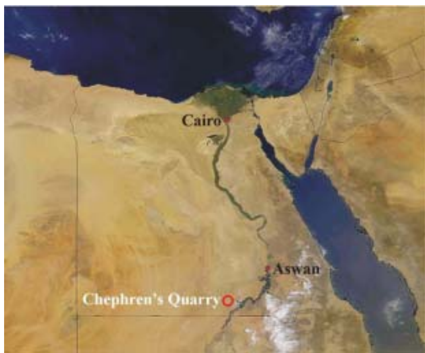
Figure 1: Map of Egypt and location of Chephren's Quarry.

Chephren's Quarry is one of the world's oldest hard-stone quarries. It is situated in the easternmost part of Sahara – covering nearly 100 km<sup>2</sup> of flat, hyper-arid desert, some 60 km west of Lake Nasser (River Nile) and the famous Abu Simbel temple in the extreme south of Egypt (Figure 1). In the 3<sup>rd</sup> and 4<sup>th</sup> millennium BC, as the climate was more favourable than today, the quarry was used for extraction of stone for now world-famous sculptures and thousands of smaller funerary objects, especially vessels.