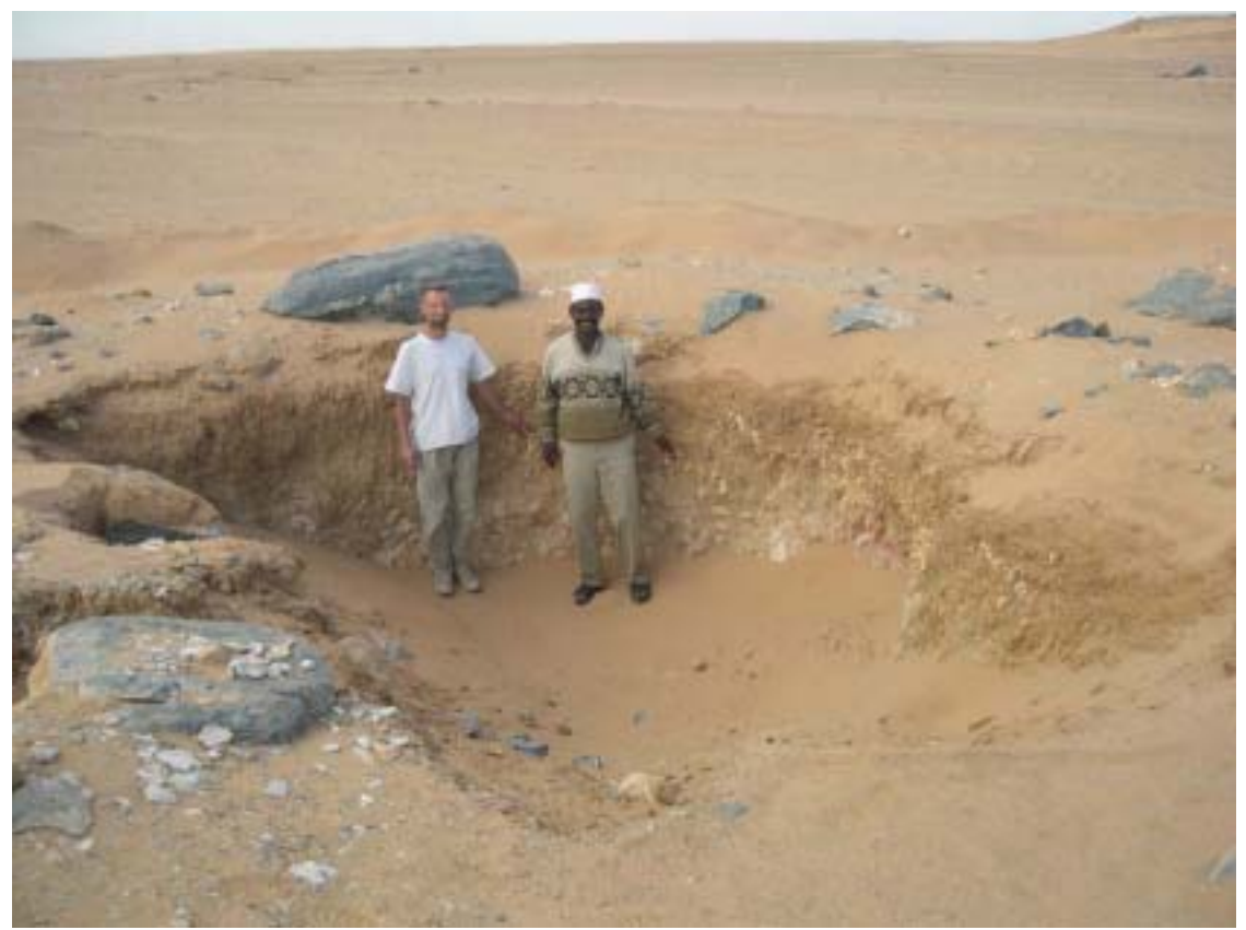
Figure 10: Deep hole left after the extraction of one, large single block. The Photograph is taken after Archaeological excavation.