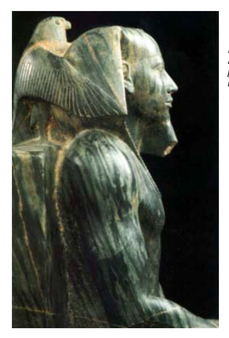
Figure 2: Statue of the 4th Dynasti King Chephren, performed in a banded variety of the Chephren Gneiss.

Chephren's Quarry is the only known source in Egypt of the highly characteristic, bluish anorthositic to dioritic gneiss (the "Chephren Gneiss") used for elite funerary objects, particularly during the Old Kingdom. Furthermore, it was used for the famous 4<sup>th</sup> Dynasty life-size statues of Chephren (Figure 2) and thus represents one of the oldest stones used for statues worldwide. The most intensive period of exploitation took place during the late 2<sup>nd</sup> Dynasty into the early 4<sup>th</sup> Dynasty for stone vessel manufacture, as exemplified by the huge quantities of anorthosite gneiss vessels found in royal tombs. However, the stone has also been found in elite burial contexts as early as the Late Neolithic. The quarry thus has a long history of exploitation for elite status stone objects and specific work areas represented by boulder quarries scattered over the area can be related to these periods of use. It is clear that the region can provide significant insight into ancient hard stone quarrying methods and a framework for understanding the logistics and social organisation of these activities.