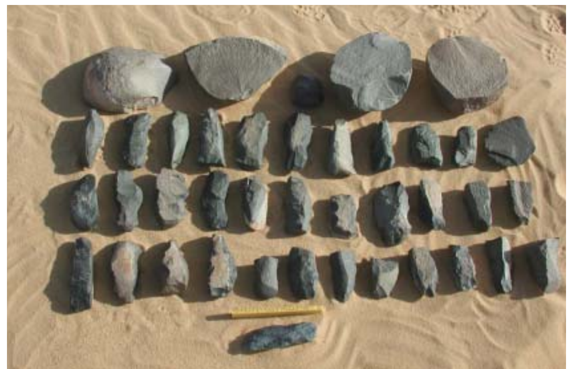
Figure 9: A collection of tools from one larger quarry. Broken pounders (top row) and handaxes.