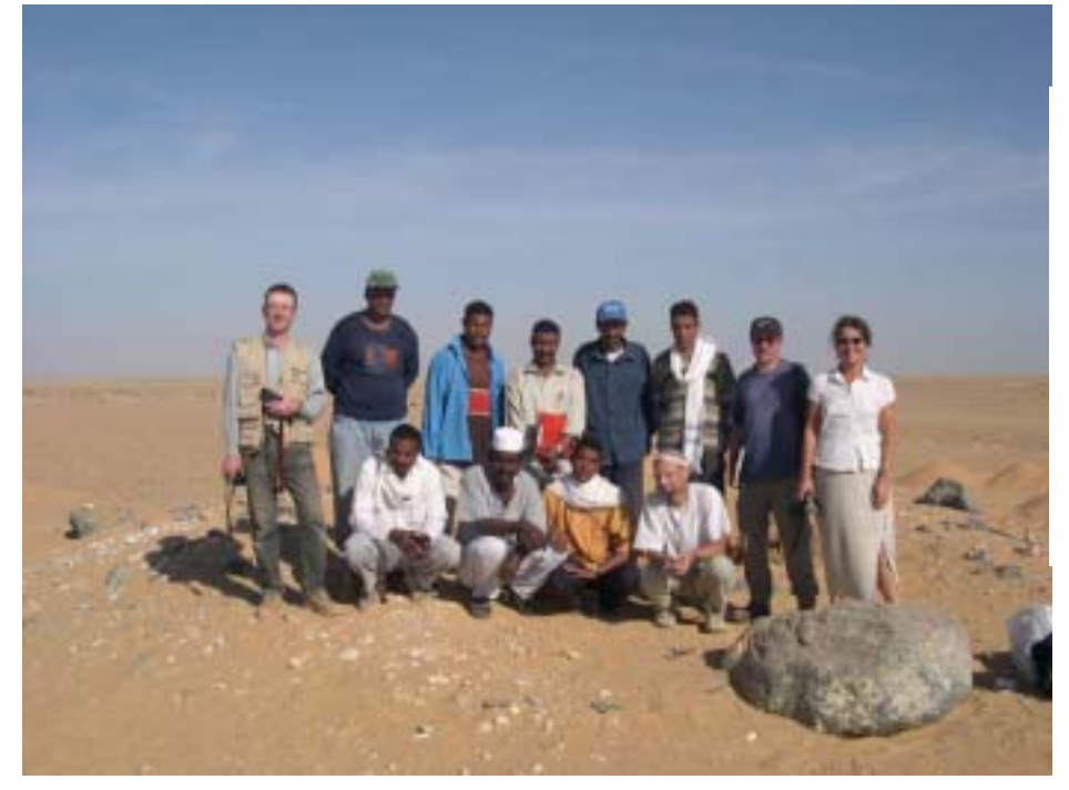
Figure 6: Part of the 2003 team.