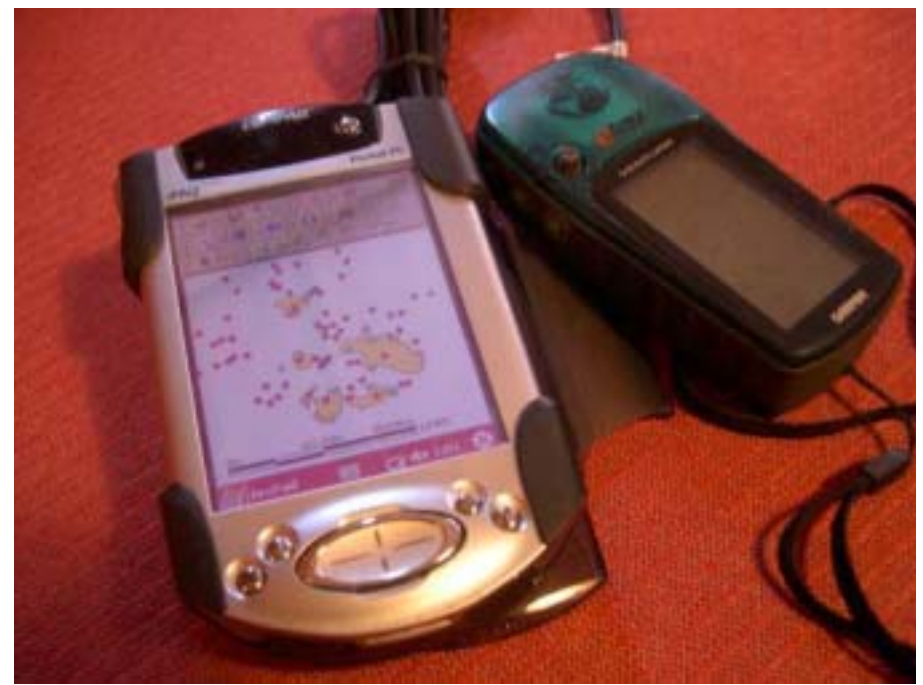
Figure 7: Ipaq pocket computer connected to a Garmin eTrex Venture GPS was used for mapping in the field.