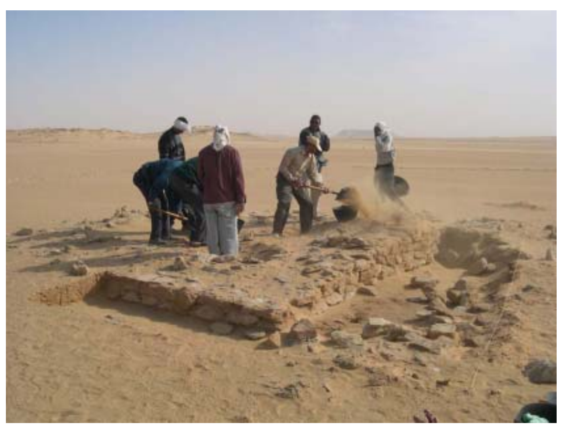
Figure 11: Excavation of a shallow well by the ancient track, with building structures for watering animals.