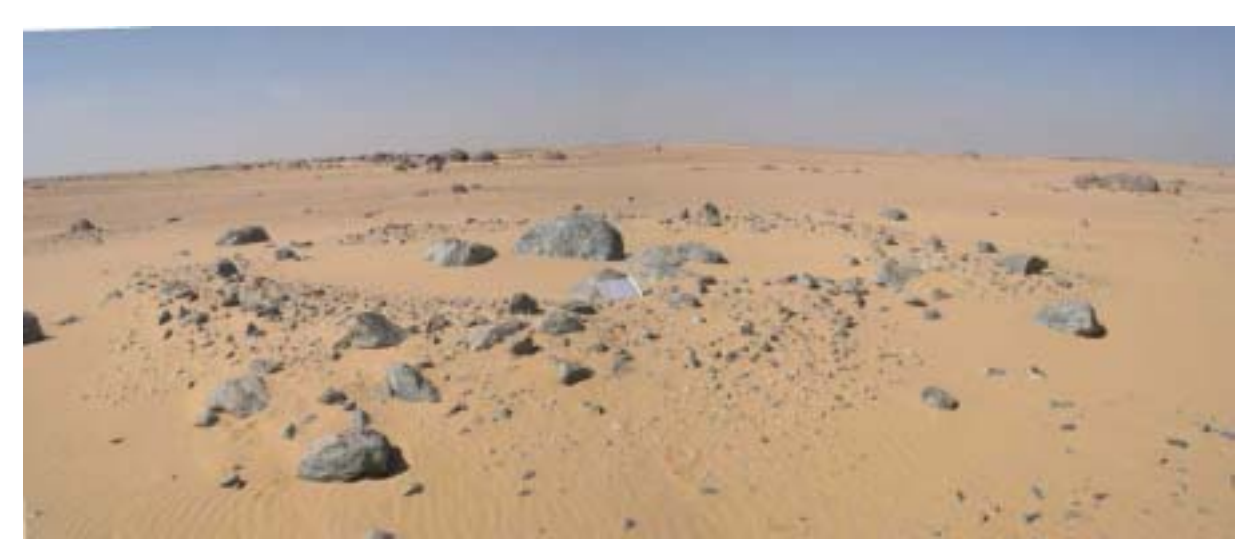
Figure 13: Small ancient extraction site showing remains of gneiss boulder in the centre and concentric spoil heaps around.

Most of the quarries are small extractions aimed at one or small groups of such boulders, leaving a concentric spoil heap around the boulder location after quarrying (Figure 14). The spoil heaps predominantly consist of weathered rock and soil, reflecting the depth of the trenches made around the boulders.