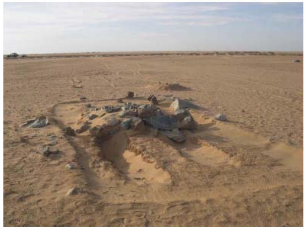
Figure 17: Parallel trenches in front of a small loading ramp, possible designed for a sledge-like transport media.