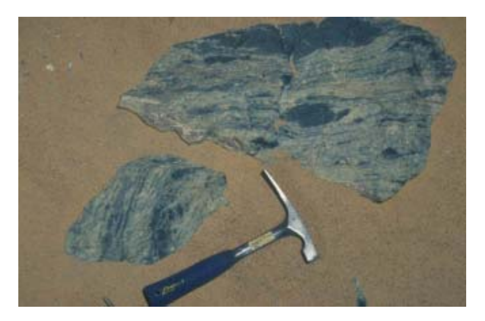
Figure 12: Partly banded and partly speckled Chephren Gneiss.

Chephren's Quarry is situated in Precambrian rocks, occurring as a "window" were younger rocks have been removed by erosion. The rock type that was subjected to quarrying is a light bluish, greyish to white gneiss with dark bands and spots – hereafter referred to as the Chephren Gneiss. It is predominantly composed of plagioclase feldspar (light coloured) and amphiboles (dark coloured), and will lithologically range from anorthosite gneiss to amphibolite gneiss (Figure 12).