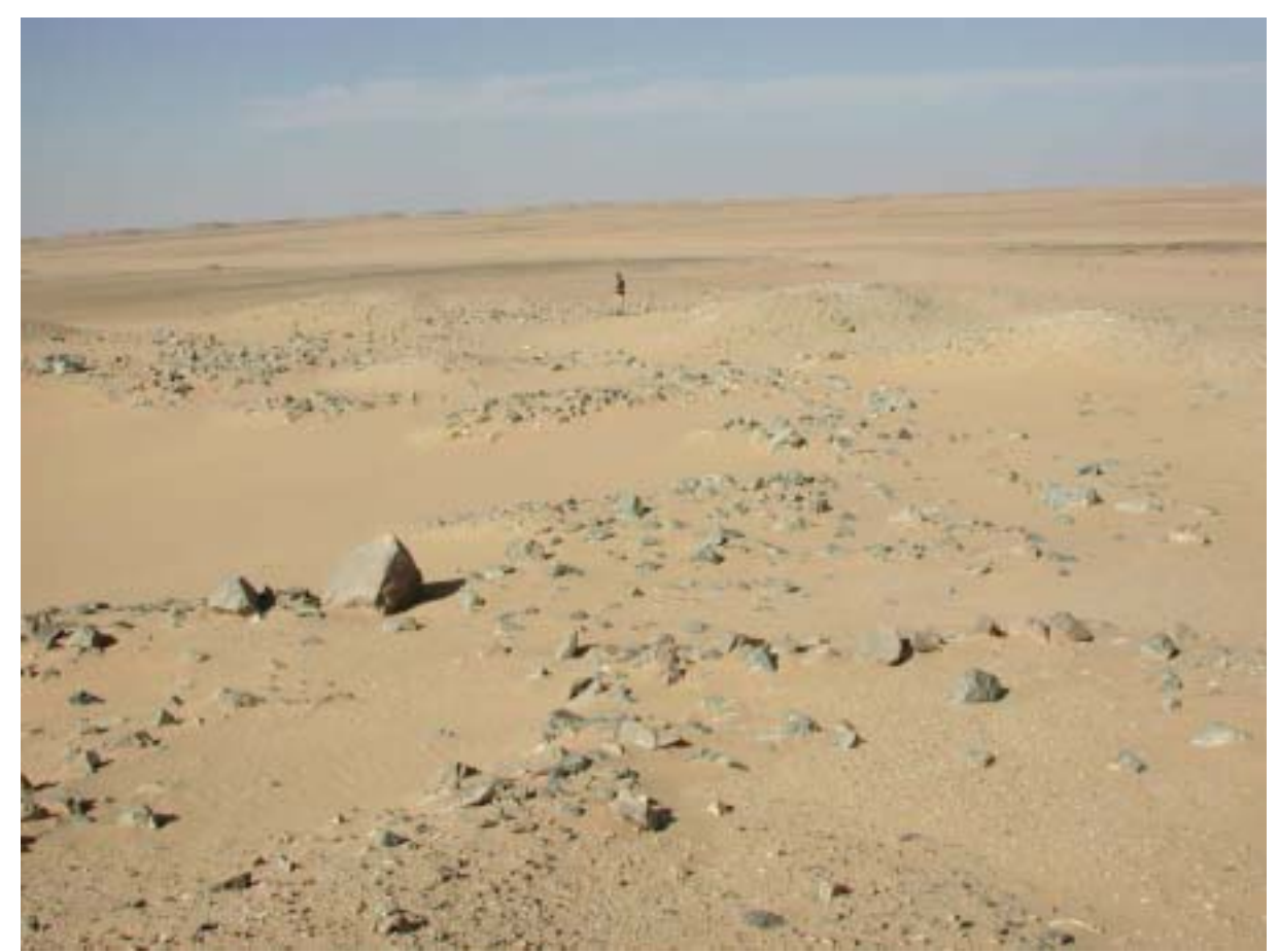
Figure 3: Rock fragments and spoil heaps in one of the ancient quarries.