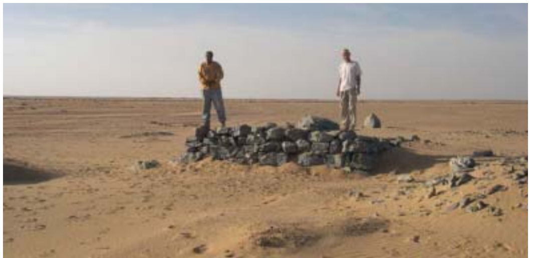
Figure 16: One of the main loading ramps.

At places were large statue blocks were collected for transport, loading ramps were constructed (Figure 17). In front of the steep end, two parallel trenches, fitting a sledge-like transport vehicle, have been found during archaeological excavations (Figure 18).