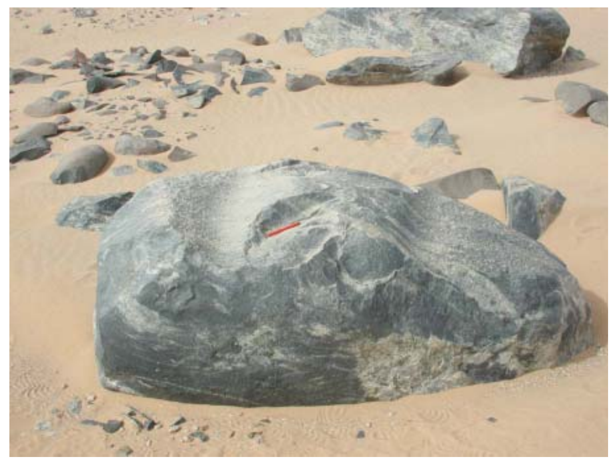
Figure 8: One of the newly discovered statue blocks, partly finished. The broken pounders, found near the block, have been used for final shaping and dressing.