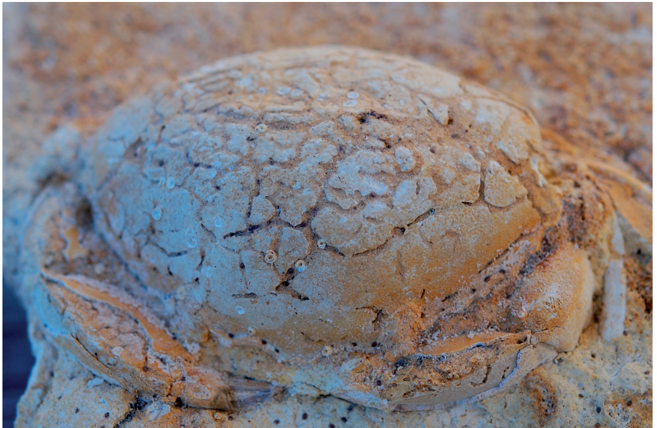
Figure 3. Erratic block with the fossil crab Palaeocarpilius found on Tjonnøya, Averøy (3.1) and close up frontal view of the crab (3.2). The size of the carapace is 10.5×7.0 cm.