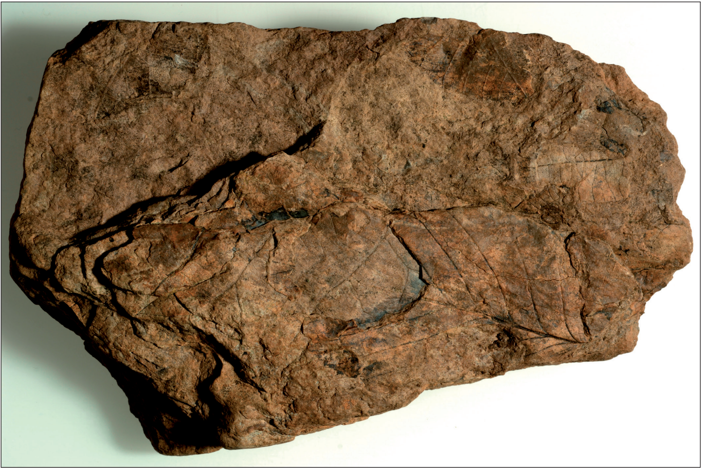
Figure 2. Erratic sandstone with fossil plant leaves found at Åneslia, Frei. The size of the block is approximate 25×40 cm.