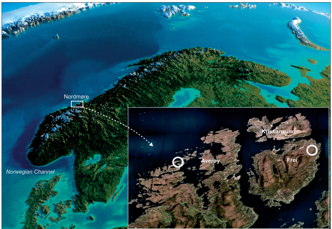
Figure 1. Location map of Early Tertiary erratic blocks found on Averøy and Frei, Nordmøre.

Erratic blocks with Mesozoic fossils and coal are found at several locations along the Norwegian Coast (Ravn and Vogt 1915, Oftedal 1972, Fürsich and Thomsen 2005, Bøe et al. 2008, 2010, Petersen et al. 2013). Most of them originate from nearby offshore or in-shore sedimentary basins (Bøe et al. 2008, 2010), but some blocks may have been transported over longer distances by the sea-ice. To the authors' best knowledge, the Paleogene fossils found at Averøy and Frei are the first on-shore records of Early Tertiary fossils in Norway (excluding Svalbard). The present paper gives a concise description of the fossils and correlates the macrofossil fossil assemblages with comparable assemblages described elsewhere in Europe and the micro-floras with time-equivalent assemblages reported from the Norwegian Shelf. Possible paleogeographic implications of the recoveries of the erratic fossils are also discussed.