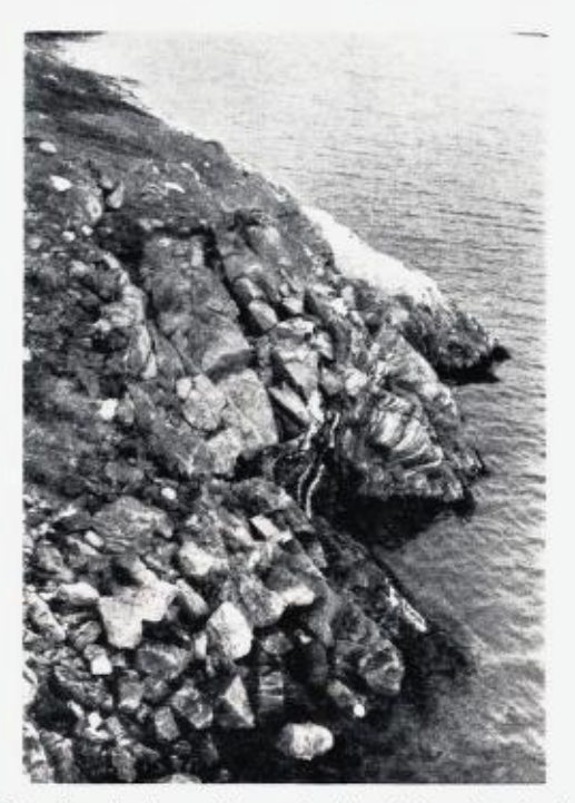
Fig. 5. The schists (banded) on the east side of the ultrabasic rock (medium grey).

Skifrene (båndete) på østsiden av ultrabasitten.