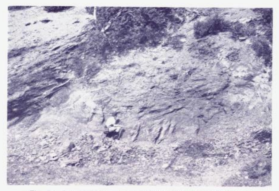
Fig. 4 a. Overfolds and thrust in the schists north of Kviteberg.

Overfoldninger og skyvning i skiferen nord for Kvifeberg.