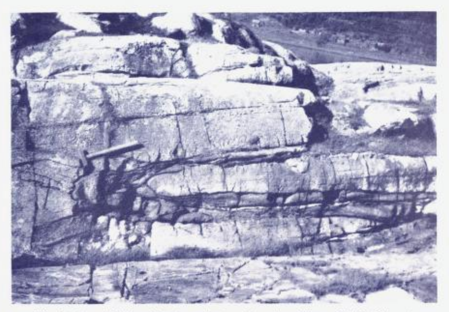
Fig. 3. Overfolded schist layer in the dolomite. Overfoldet skiferlag i dolomitten.

skarn layers occurring near the bottom. There is a basal quartz and feldspar pebble conglomerate. Quartz occurs in "trains", veinlets, and stringers; the biotite is strongly pleochroic and very well oriented, being best preserved in the stress shadows of the feldspar "augen"; the garnets are very rich in inclusions; the plagioclase (basic oligoclase) is strained, sometimes somewhat rounded, and surrounded by envelopes of small quartz and K-feldspar grains; K-feldspar occurs as clear "augen" showing very weakly developed polysynthetic "cross-hatch" twinning and with myrmekitic boundaries, and as small grains in stress shadows together with quartz; apatite and zoisite are rare. The examination of the rock in thin-section reveals it to be a considerably sheared and somewhat recrystallized rock.