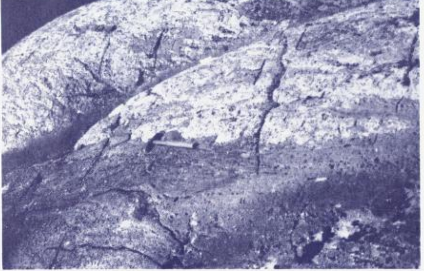
Fig. 1. The dolomite at Kviteberg. Below the hammer can be seen the dolomite (dark grey) with numerous diopside crystals. Above the hammer the diopside (light gray) is more abundant than the dolomite which occurs as lenses.

Dolomitten ved Kviteberg. Under hammeren ses dolomitten (mørk grå) med diopsidkrystaller. Over hammeren dominerer diopsiden (lys grå) med dolomit bare som linser.